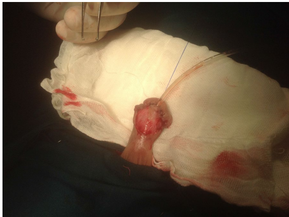
Fig. 4 Covering the urethral plate with the first part of the flap