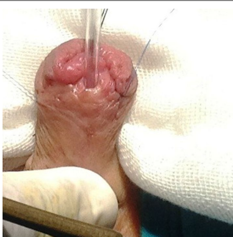
Fig. 1 Redo distal penile hypospadias with small glans penis with most of the prepuce was lost in the previous operations

A midline fixing suture was taken at the glans (Fig. 1). We started the procedure by measuring the length of the urethral plate and the length of the glans, from the