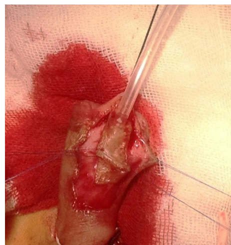
Fig. 3 Fashioning the meatal-based flap and extending the incision till it reaches the urethral knob