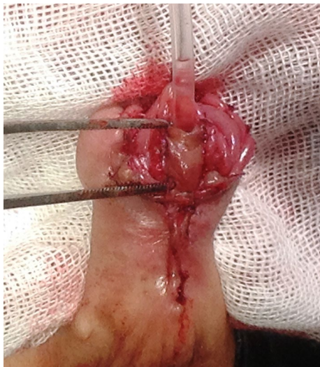
Fig. 5 The remaining part of the flap bridges the defect of the glans penis and prepared to be sutured to the sides of the glans edges