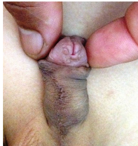
Fig. 7 At 6-month follow-up

part of the flap would bridge the ventral defect of the glans penis without creating penile curvature. Vicryl 6/0 sutures were used to evert the flap upwards to the edges of the urethral plate. The sutures were taken in a subcuticular fashion on the two sides till the urethral knop (Fig. 4). At that time, the urethra was covered with part of the harvested meatal-based flap and continued to the level of the urethral knop of the glans penis. The remaining part of the flap was everted backward like an apron, and each side of the flap was sutured to the ipsilateral side of the glans using 6/0 Vicryl in a continuous subcuticular manner (Fig. 5). Thereafter, the lateral skin was approximated at the midline ventrally (Fig. 6). An 8 Fr. feeding tube was fixed using the midline glans