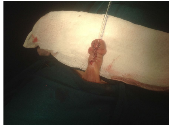
Fig. 6 Skin closure at the midline after completing the procedure